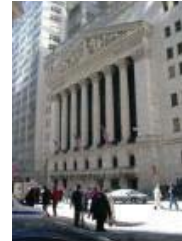
New York Stock Exchange

After dinner a pub crawl will be organized at the Novotel Of New York for those who wish to attend.