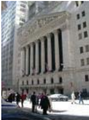
New York Stock Exchange

New York Stock Exchange 20 Broad Street, New York, NY 10005