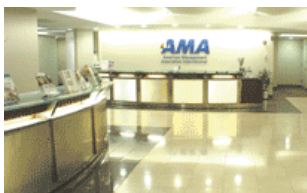
American Management Association